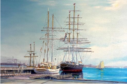
Jack Woods Williamstown Docks 2010