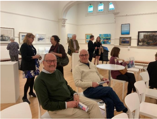
Unknow entities but obviously quite famous.